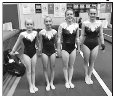
USA Level 4