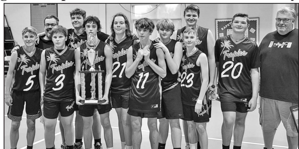
The 8th grade Tropics local basketball team repeated as Fannin County Christmas Clash champions.

The Tropics are made up of 8th-graders from Towns, Union and Fannin counties and Andrews, North Carolina. This is their second year competing in the tournament and are now